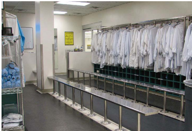
Changing area covered with Dychem Polymeric Floor Coverings