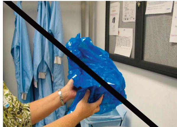
Blue tack mats no longer required