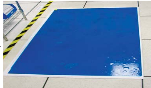
One blue tack mat being used in the changing area.

A major Medical Device Manufacturer operating in Hybrid Manufacturing areas has evaluated the polymeric floor coverings in comparison to the tack mats that were previously being used. Various consumables are used in the facilities gowning room including bouffants, face masks, garments, ESD shoes, and gloves. Blue tack mats were used to capture dirt from operatives "street shoes" as they entered the gowning room. The building where tests were conducted spent $24,000 on tack mats per annum. This building disposed of approximately one ton (2028 lbs) of used plastic peel off mat sheets in the trash per annum.