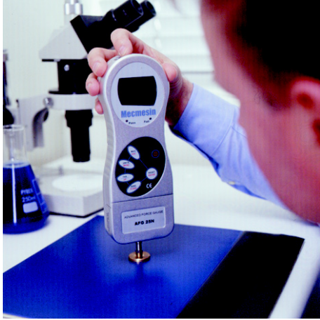
Dycem Tack Meter

The Dycem Tack Meter imitates placing a foot on a tacky surface and lifting it off. The meter measures the force required to pull the imitation brass foot from the surface of the tacky flooring. The reading therefore quantifies the vertical tack of the flooring, and this reading directly correlates with the ability of the surface to collect and retain particulate. The metered is invaluable in terms of monitoring the ageing process of the tacky flooring in order to determine its efficiency and eventually the need to replace the product. Tack meters are available to all Dycem customers.