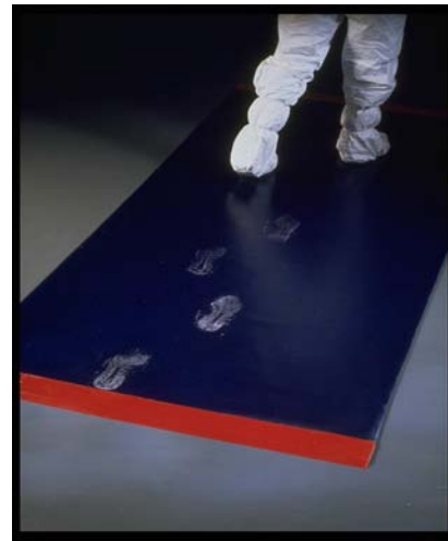
Dycem Low-Profile Protectamat

Furthermore Dycem has instigated and funded the development of an instrument to measure the vertical tack of polymeric flooring.